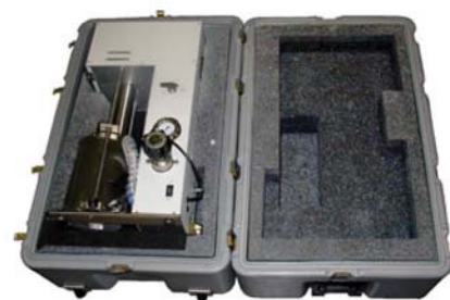
Optional carrying case with extendable handle and wheels for easy portability