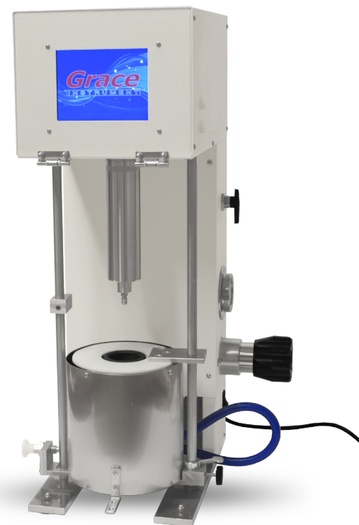
M5600 HPHT Rheometer shown in carbon block bath