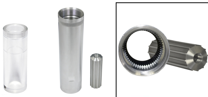
Clear sample cup