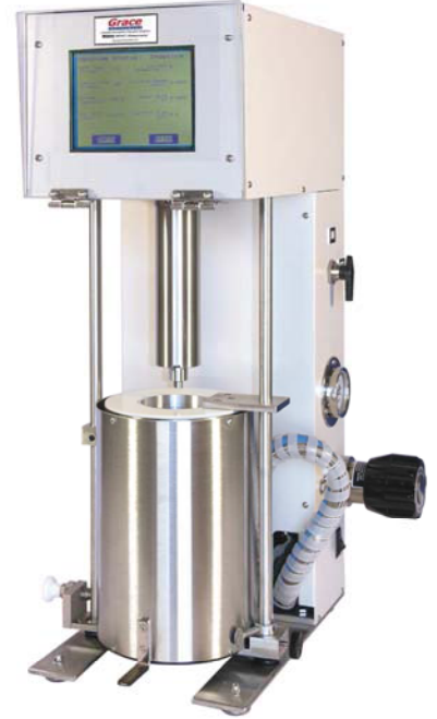
M5600 Rheometer is shown with oil bath option

The M5600 is also available in an oil bath. The oil bath allows for cooling options and an operator can connect tubing to supply water for cooling capabilities.